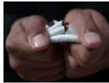
Banning the purchase of cigarettes and other tobacco products for youth can significantly prevent 12 lakh lung cancer deaths in the young population, according to a study, published in The Lancet Public Health journal on Thursday.

The findings aim to secure future generations from the risks of smoking, which is the biggest risk factor for lung cancer. Smoking is the leading cause of preventable death worldwide and is estimated to cause more than two-thirds of the 18 lakh deaths every year.